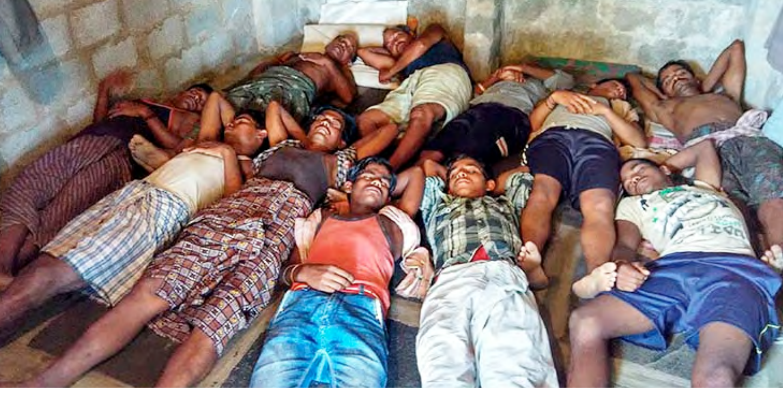
Migrant workers sleeping in their accomodation