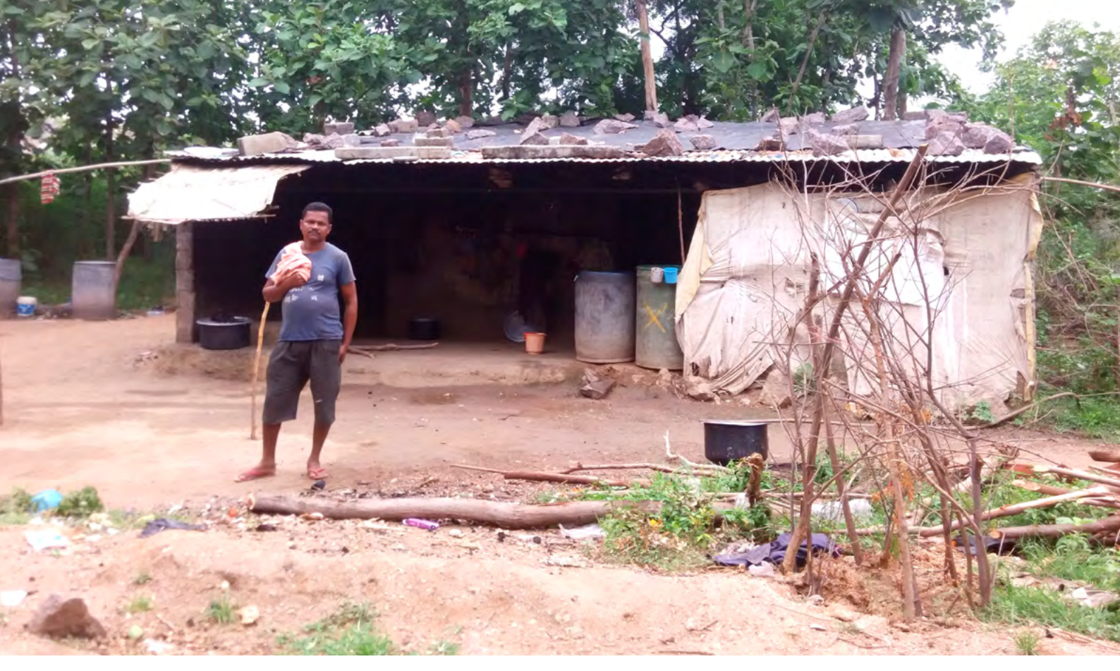
Worker in front of the cooking and dining hall for migrant workers in a quarry