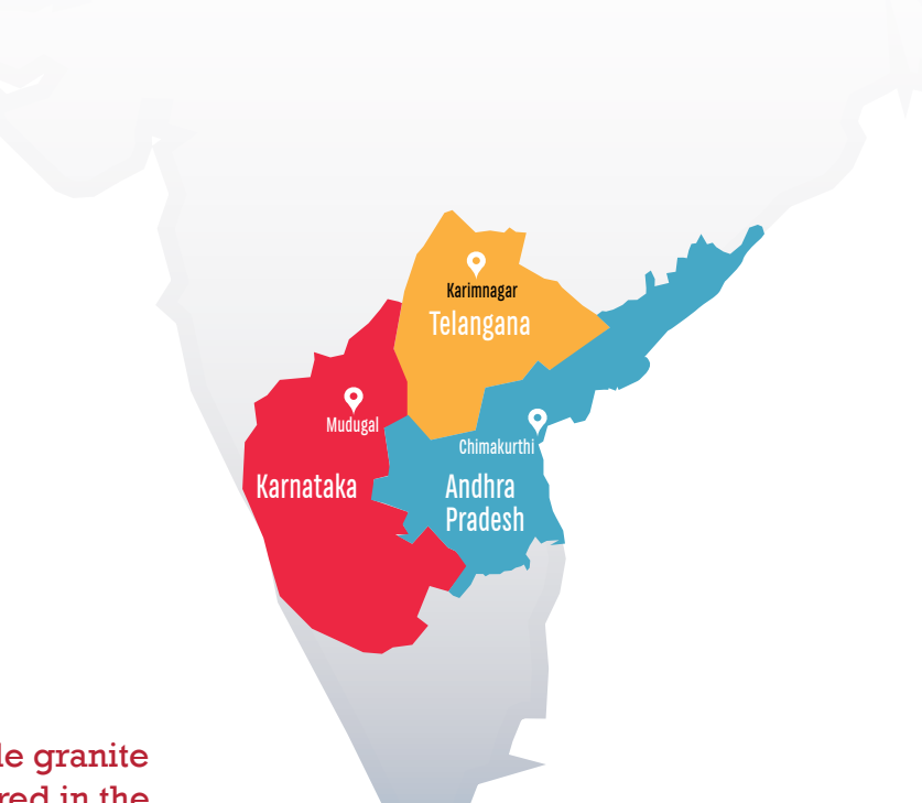
Table 1: Sample granite quarries covered in the study