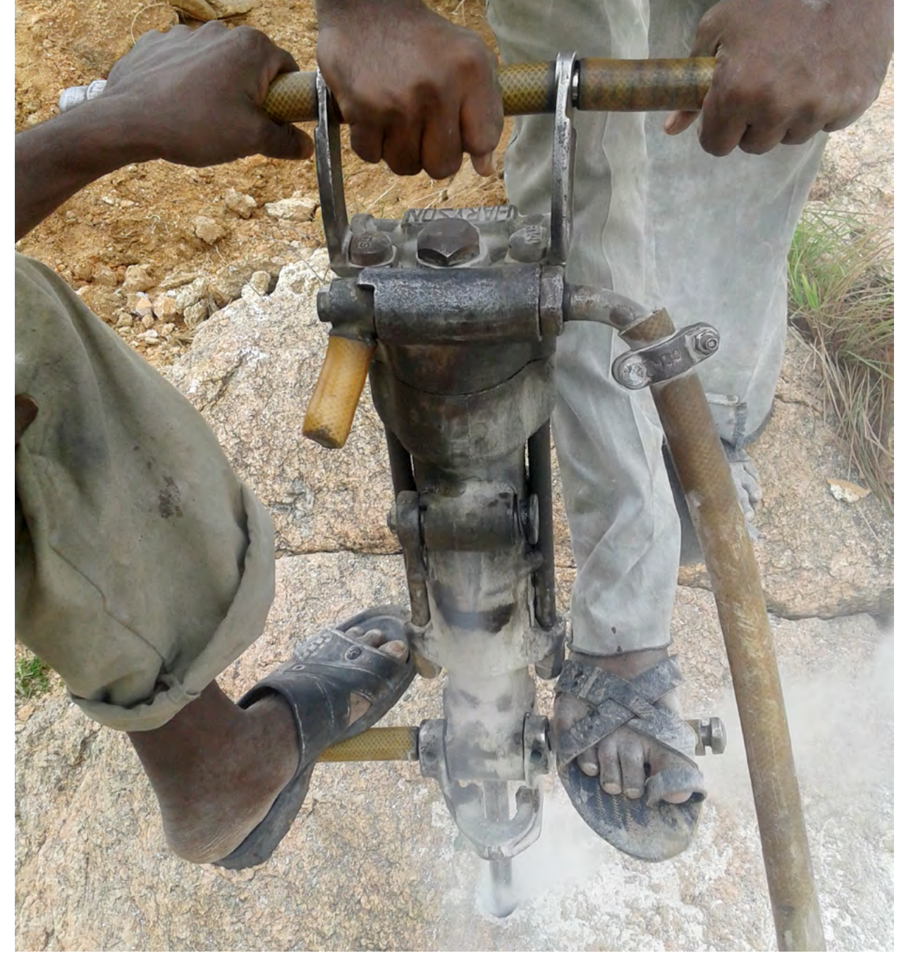
Quarry workers operating the drilling machine without using protective equipment