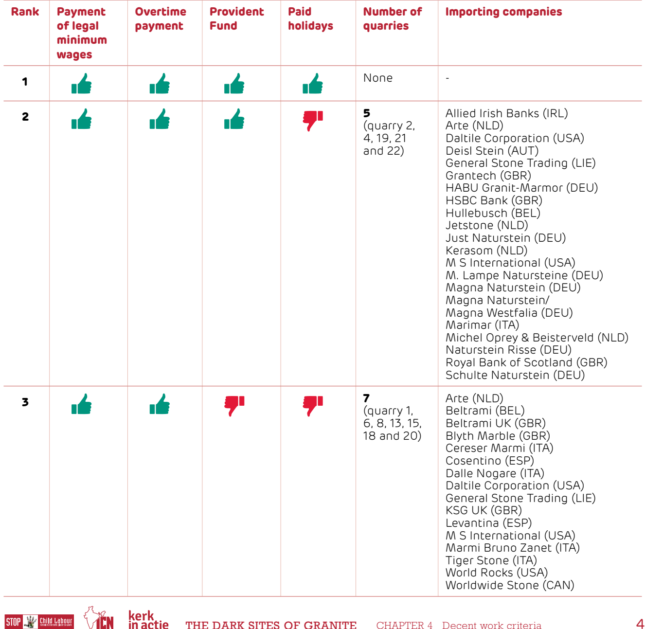
Table 15: Ranking of quarries on wage and social benefits criteria

Table 15 shows the ranking of sample guarries on wage and benefits criteria. The four indicators used for these criteria are as per the law: a) Payment of legal minimum wages, b) overtime payment, c) payment of provident fund to workers and d) paid holidays.<sup>41</sup> Quarries fulfilling all the four criteria are ranking 1<sup>st</sup> and those not fulfilling any of the four criteria are ranking 5<sup>th</sup>. As shown in table 15, in five quarries (quarry 7, 9, 10, 11 and 12), who are ranking 5<sup>th</sup>, wage rates are below the legal minimum requirement. Four of these quarries are located in Karnataka (quarry 9, 10, 11 and 12) and one in Telangana (quarry 7). In the quarries (quarry 3, 5, 14, 16 and 17) that are in 4<sup>th</sup> rank minimum wages are paid, but workers do not receive overtime payment, provident fund and paid holidays. In quarries that are ranking 3<sup>rd</sup> (quarry 1, 6, 8, 13, 15, 18 and 20) minimum wages and overtime is paid. Quarries that are paying legal minimum wages, overtime (twice the minimum wage rates) and provident fund are ranking 2<sup>nd</sup>. Five quarries (quarry 2, 4, 19, 21 and 22) qualify these criteria; most of these are big exporting quarries located in Andhra Pradesh. None of the sample quarries are eligible for 1<sup>st</sup> rank. None of the quarries are providing paid holidays to workers who are hired on temporary basis.