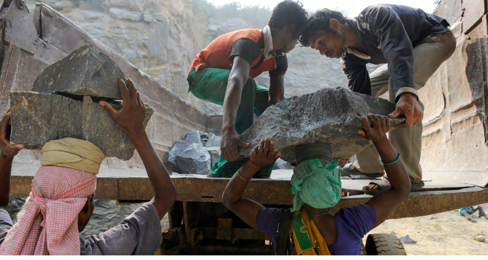
Workers loading waste stone in a truck