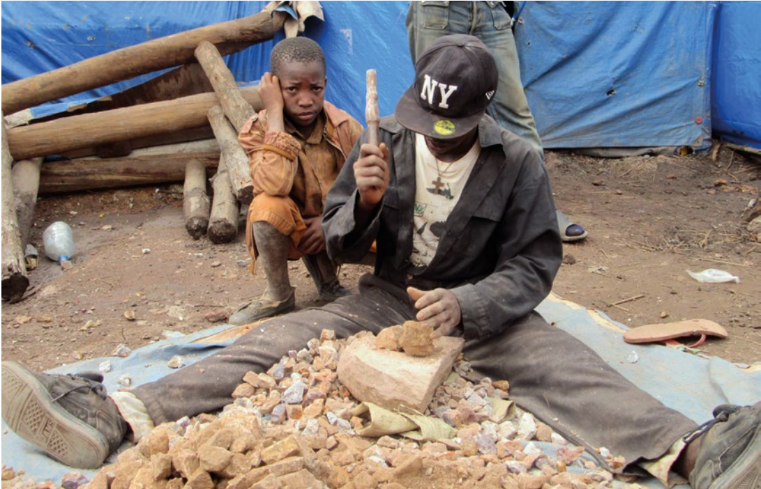
The bigger rocks of gold ore are pounded with a mortar into smaller pieces