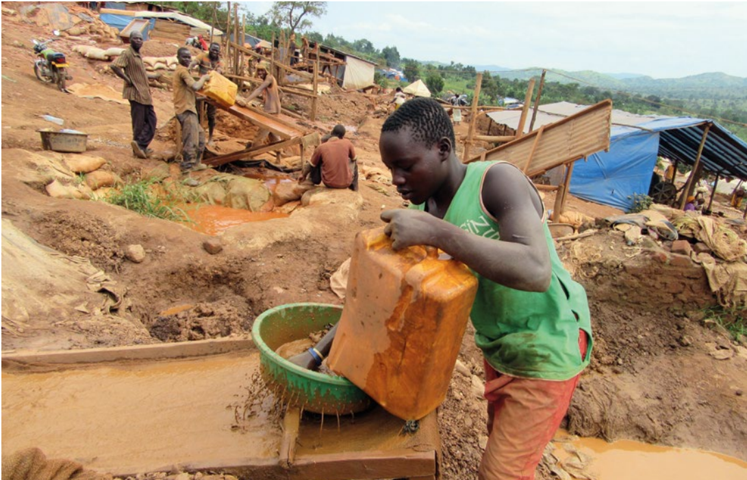
Sluicing the gold dust