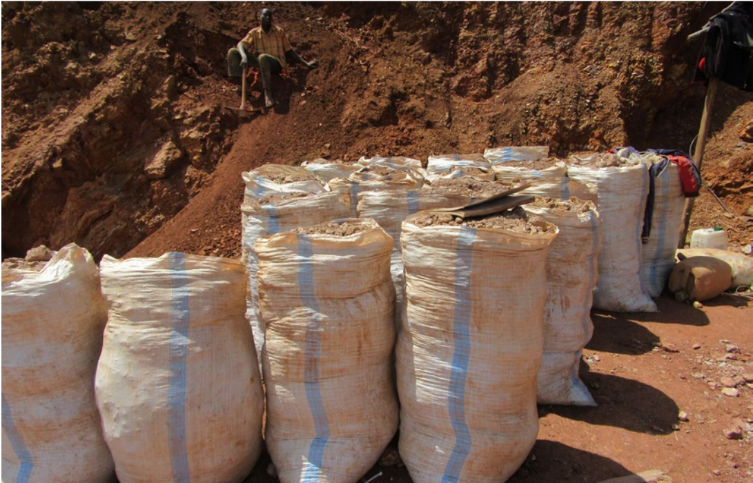
Bags with rock gold ore from the mining pits are for sale