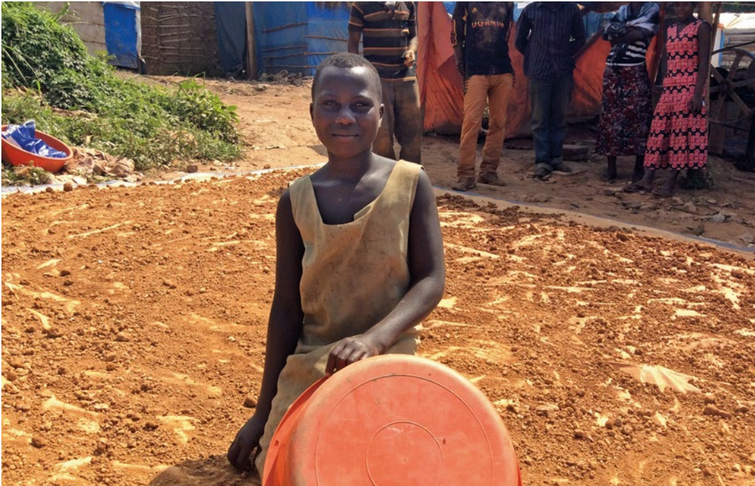
The gold ore is dried in the sun