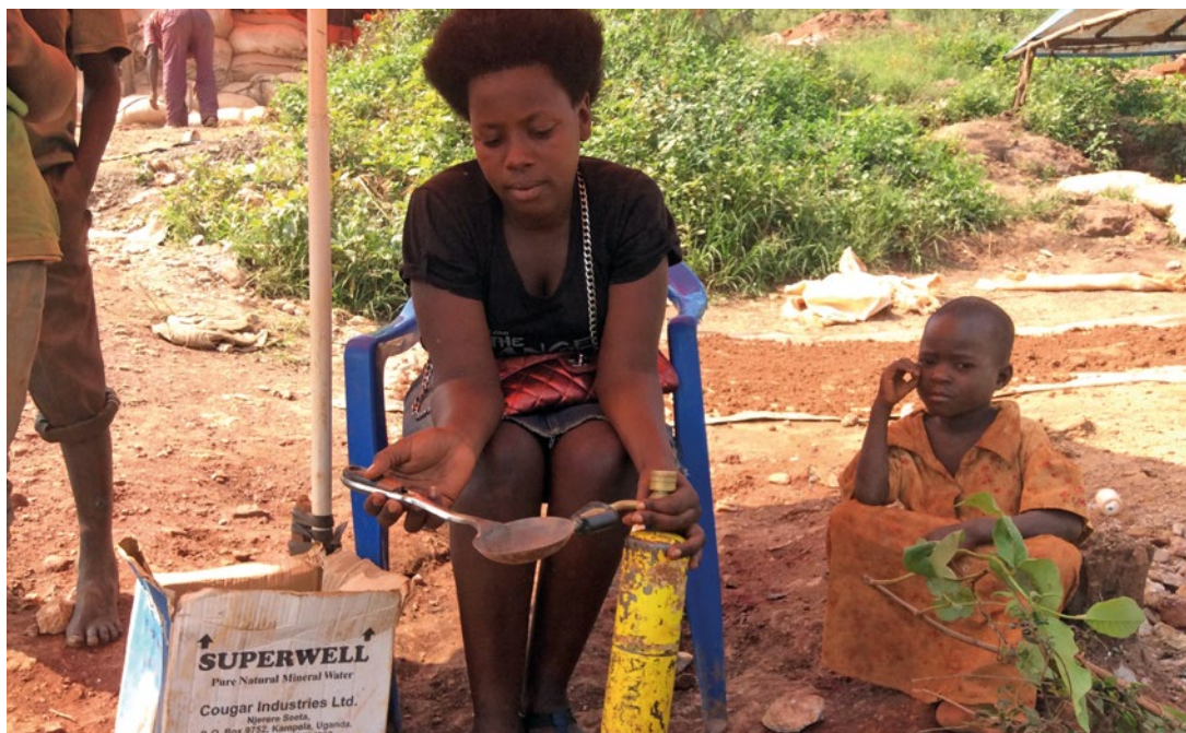
The on-site gold buyer burns the mercury-gold amalgam to evaporate the mercury

When there is not enough water available on the site to use the sluices, or when miners cannot afford to use sluices, the washing of the ore dust takes place in ponds using the method of panning.