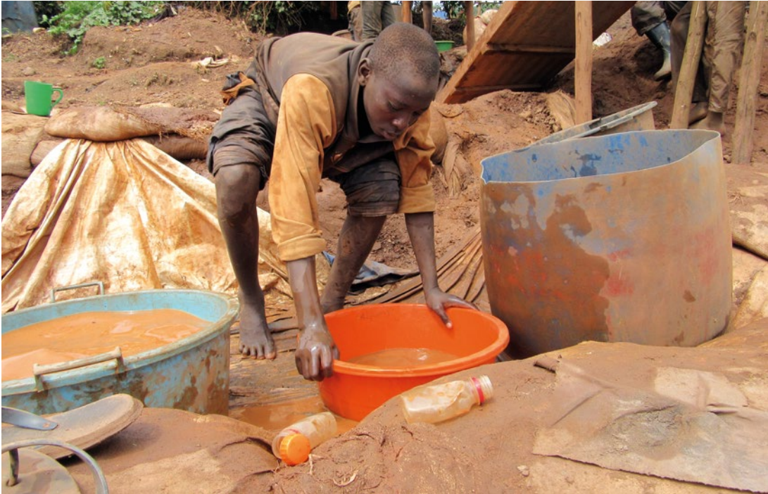
The concentrated ore dust is mixed with mercury to bind the gold