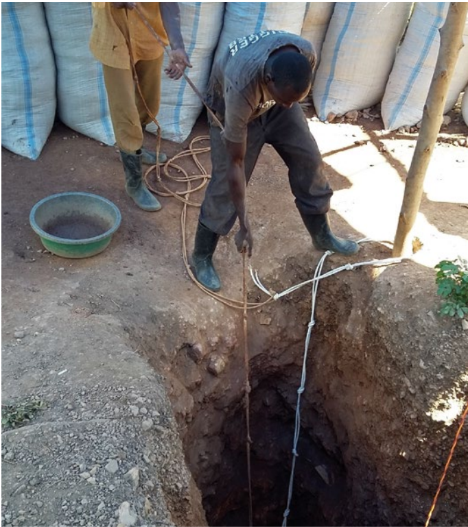
Miners dig up the gold ore from the underground mining pits