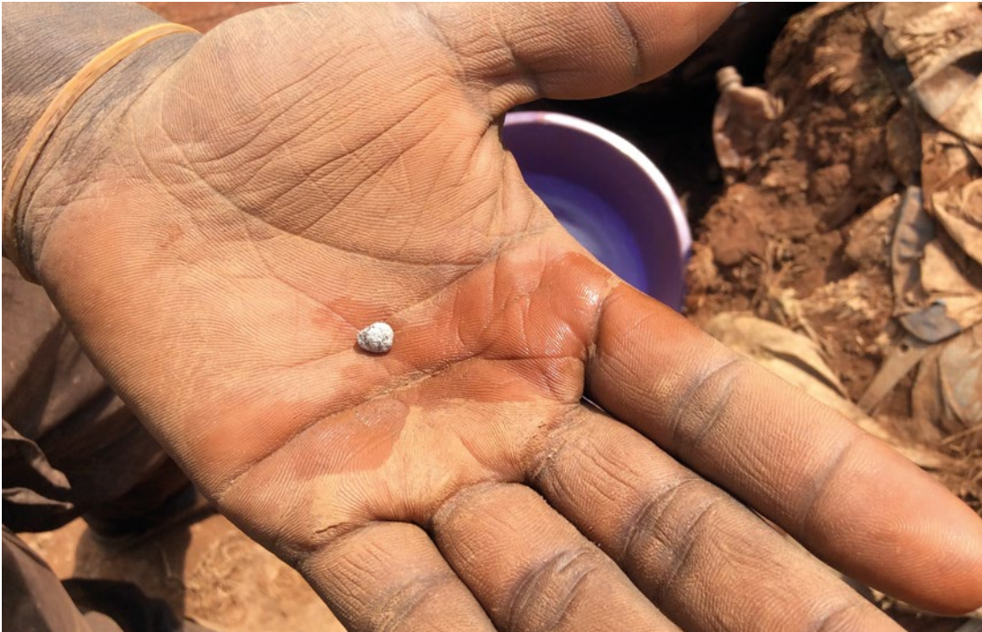
The mercury-gold amalgam