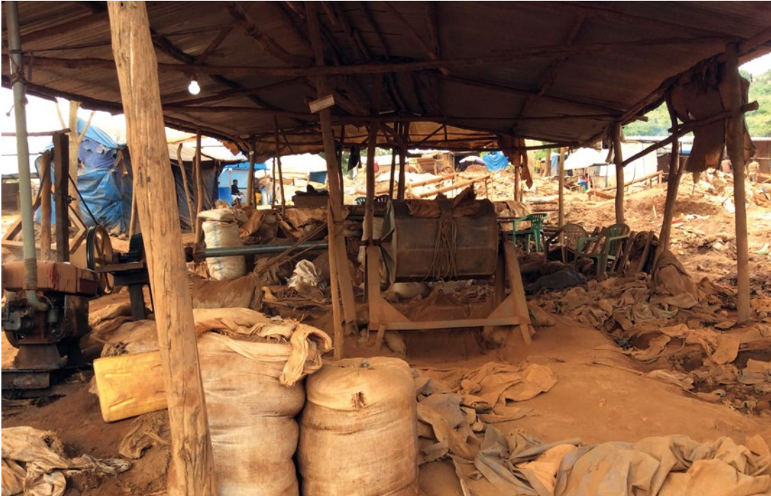
In a mill the gold ore is being grinded into gold ore dust