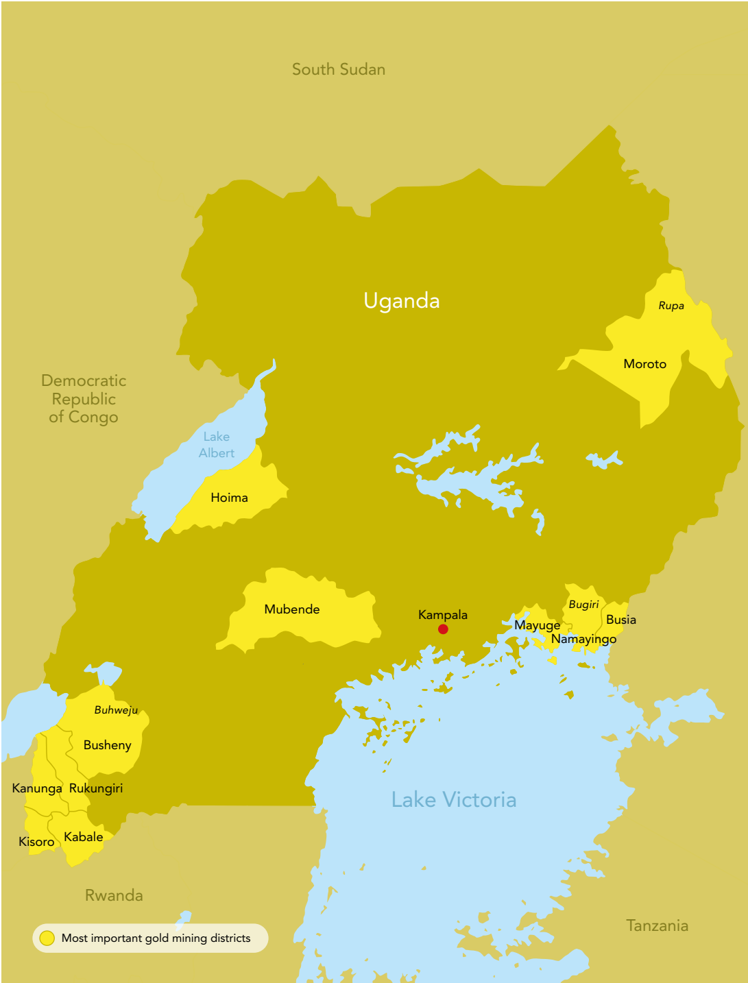
Figure 1: Gold mining districts in Uganda